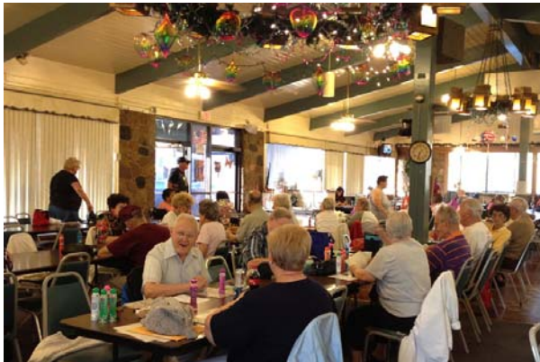
GETTING READY TO PLAY AND WIN!