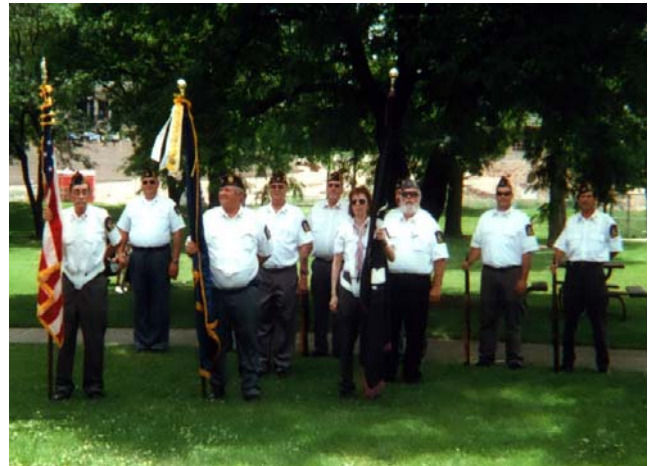
POST 18 COLORGUARD