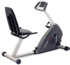
Stationary & Reclining Bikes

Arm/Leg Sitting Apparatus Massage Tables/Chairs Walking Program